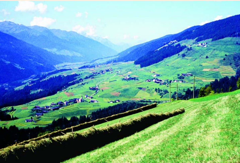
FIGURE 2 Mountain farming has created valuable settlement areas and contributes substantially to a diversified rural economy.

decreased dramatically in mountain areas, it has become a prime target of initiatives to maintain living and working opportunities in these areas. Programs initiated in the 1970s in the Alps began to address the interrelationships between sectors and the need for integrated strategies.