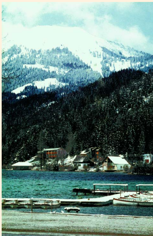
FIGURE 1 Development of winter tourism in the Alps depends on well-preserved scenic and rural amenities.

Land use has been characterized by farming and forestry in the Alps of Austria for centuries. While the importance of agriculture as a source of food has