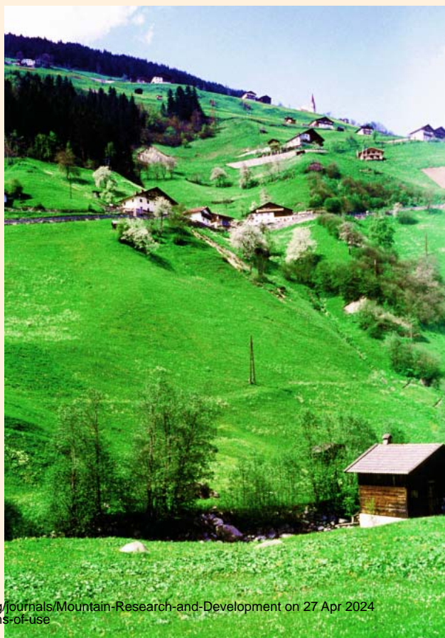
FIGURE 4 Farming still shapes Alpine landscapes but depends on on-going support to fulfill its wide-ranging tasks.

Local actors also now agree that efforts have to be renewed and that networking with other regions is a basis for exchange of experience and for keeping or regaining momentum.